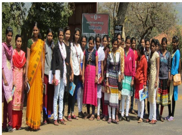
Students at Dajipur Reserve Sanctuary, Dist.: Kolhapur.