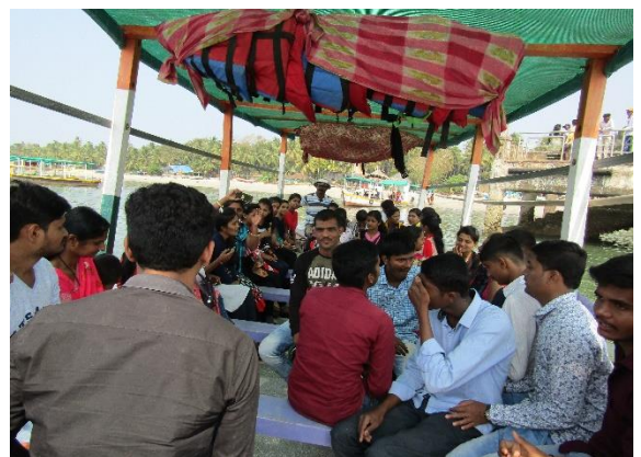
Visit to Sindhurg fort, Malvan enjoying Boating