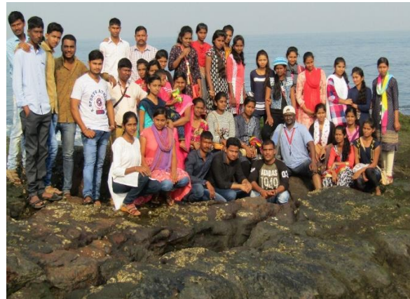
Visit to Fish Market & Rock Garden at Tar Karli, Malvan